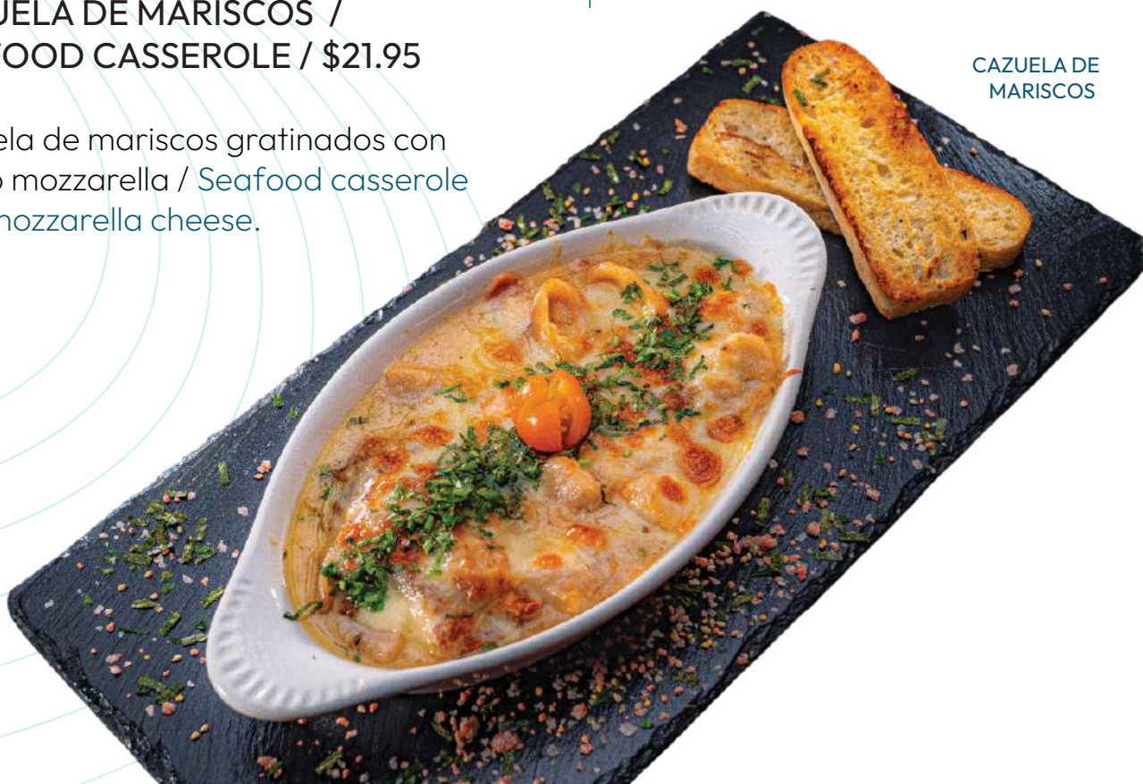
CAZUELA DE MARISCOS